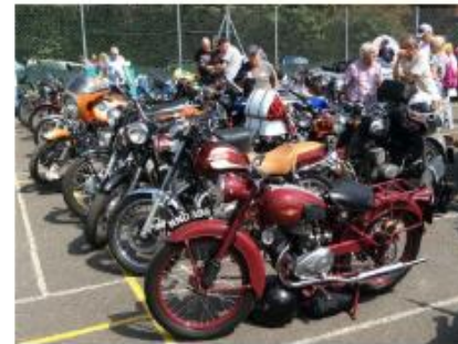
A multitude of motorbikes