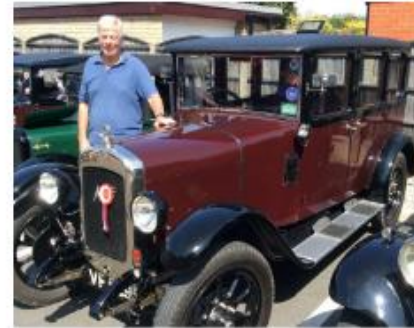
Winning pre-1939 car – Austin 12