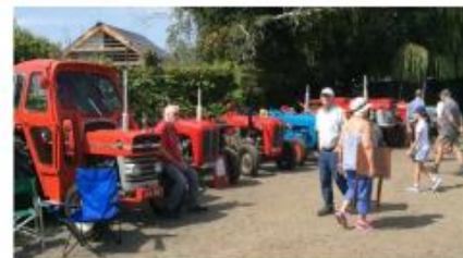
Steam and diesel tractors

For the fourth year since the new Village Hall was opened, this fantastic event took place on Sunday 10 th August and it was the biggest and best yet. Superb weather, 35 volunteers, 240 classic vehicles and 1000 people made the event a huge success.